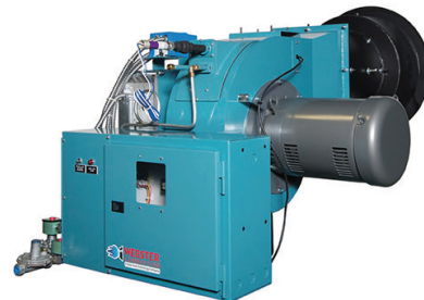
JBS Series High Efficiency, High Turndown Burners