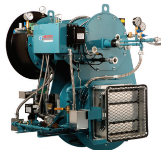
HDS Series High Efficiency, High Turndown Burners