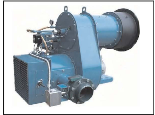
Webster Model HDRMB™ Ultra Low NOx Burner

*U.S. Patent Numbers 5,407,347 and 5,470,224